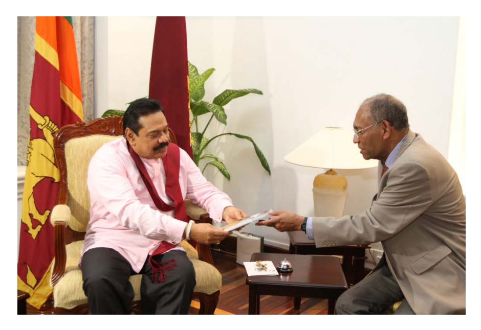
Discussions about the Polonnaruwa meteorite