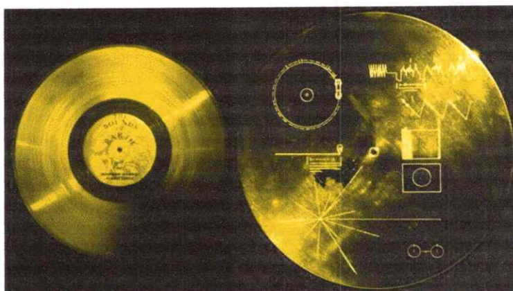
Figure 2. The golden record carried on Voyager spacecraft

Next, the New Horizons Mission to Pluto launched in 2006 carried human artefacts including an American flag and most surprisingly the ashes of Clyde Tombaugh, the American astronomer who discovered Pluto in 1930! What a shipwrecked alien coming upon such junk will make of all this is unimaginable! Perhaps William Wordsworth in this Psalm of Life said it all. What we should aim at leaving is more explicitly our intellectual cultural footprints in some indelible, and hopefully universal way, in the “sands of time”.